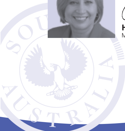
Hon Jennifer Rankine MP MINISTER FOR VOLUNTEERS

A handwritten signature in black ink that reads "Jennifer Rankine".